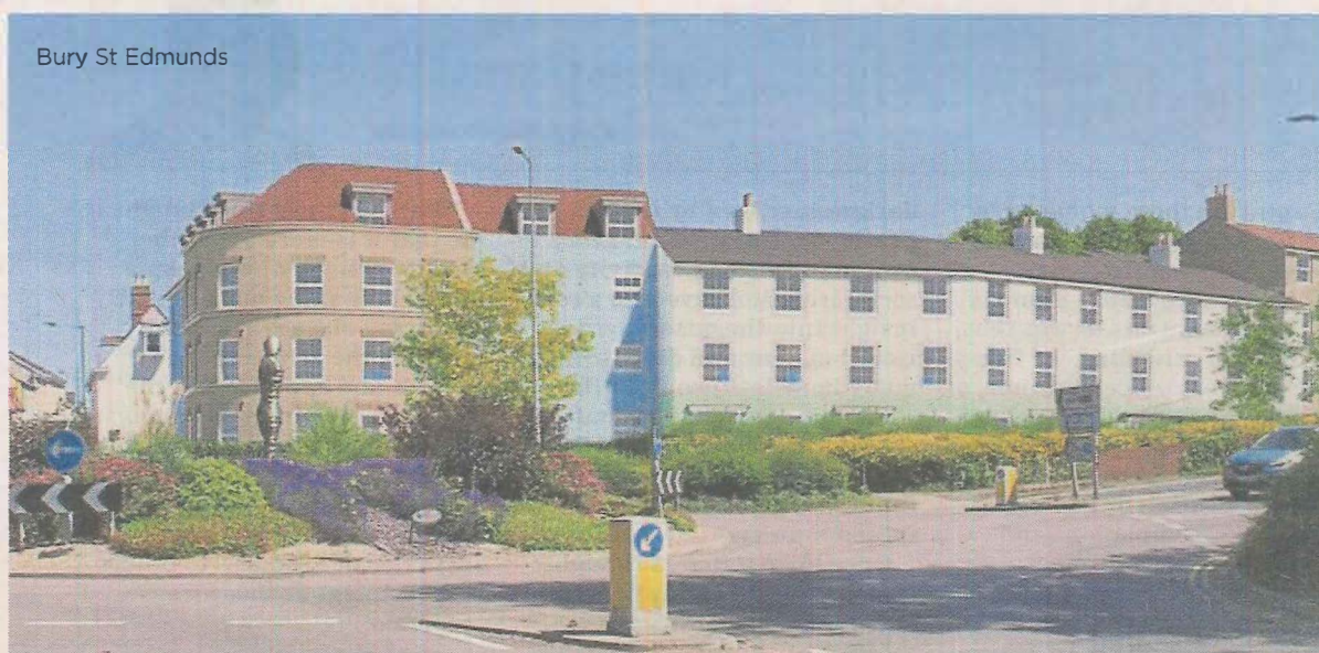
Bury St Edmunds